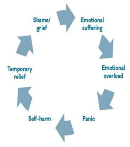
Figure 3. Self Harm Cycle

Research findings on reasons for doing self-harm are portrayed in Edmondson et al., (2016) in Fitriyana, R. (2020). Self-harm is a medium to handle stress or to regulate emotions in which people who have done self-harm feel relieved from the stress they are experiencing. Self-harm is the way to punish themselves for doing unexpected actions. As a form of disassociation escaping from many things and connecting more to self to feel the void, self-harm behaviors are one of the ways to define oneself or a validation form for his/her existence towards others. People who self-harm get used to suppressing their feelings including trying not to be too expressive. Suppression can hinder emotion-expressive behaviors that are taking place. It can harm health (Niedenthal, Krauth, & Ric, 2006).