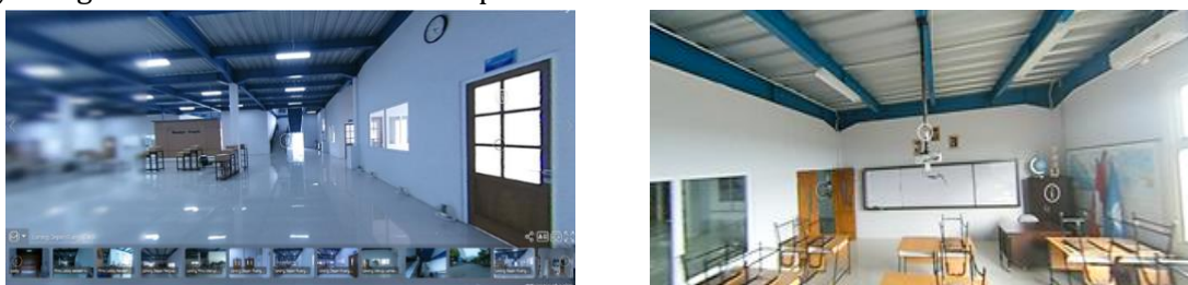
Picture 2 Virtual tour SMA Budi Cendekian Islamic School di Depok, Jawa Barat